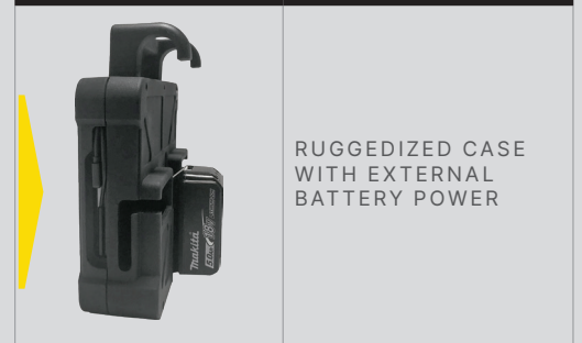
RUGGEDIZED CASE WITH EXTERNAL BATTERY POWER